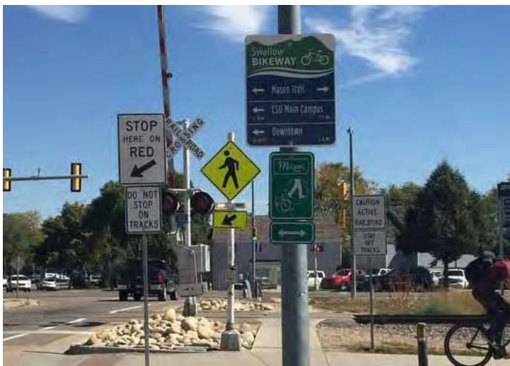
Signs provide critical regulatory and warning information as well as important guidance and direction for motorists.

Just because an existing sign is erected in the field doesn't mean it is correct.